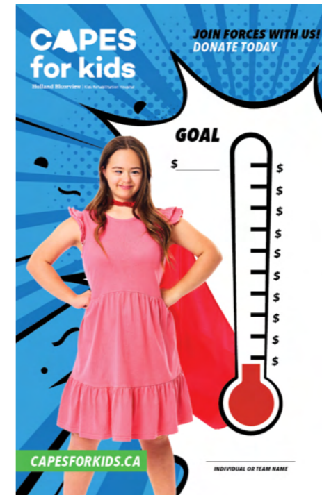
CAPES THERMOMETER POSTER

Check out all of our templates at https://capesforkids.ca/how-it-works/fundraising-resources/