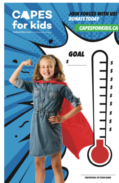
CAPES THERMOMETER POSTER