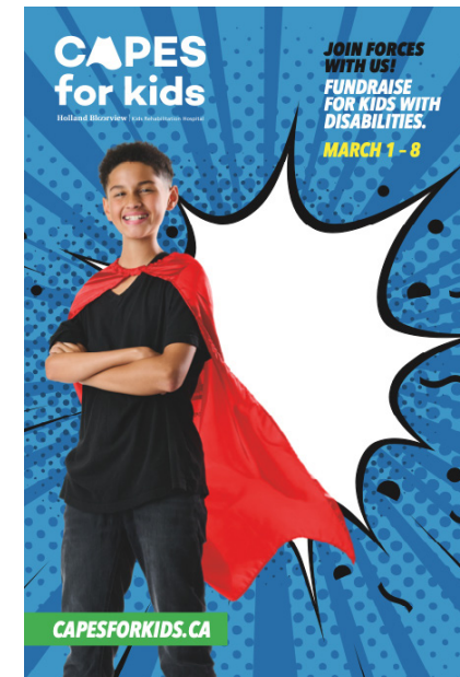
CAPES FILLABLE POSTER

Check out all of our templates at https://capesforkids.ca/how-it-works/fundraising-resources/