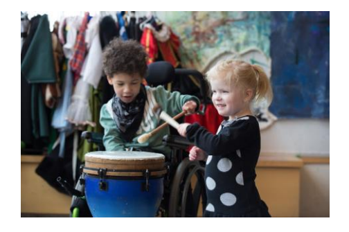
You will be providing musical therapy instruments so kids can develop new skills and find outlets to express themselves.