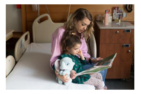
You will be helping families under financial distress purchase food, special equipment and medications that are desperately needed.