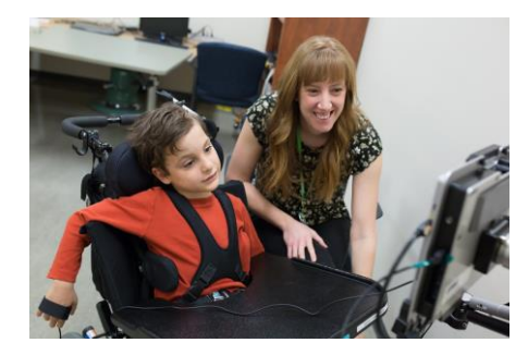
You will be supporting research and innovations that will change the future for children with disabilities across the world.

Kids with disabilities and their families have been disproportionately impacted by COVID-19. This year is more important than ever. Here's some of the way you will help: